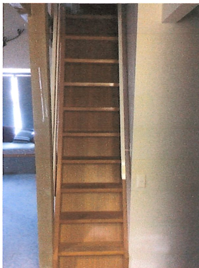
Fig. 1 Existing Ladder

The current construction utilizes a ladder to access the main sleeping area (loft). This ladder does not meet current access regulations, and is a hazard to those who use it. The proposed works will remove the ladder and cupboards, to be replaced with a new staircase. This stair will provide safe and easy access between the main sleeping area and the living/kitchen/bath areas.